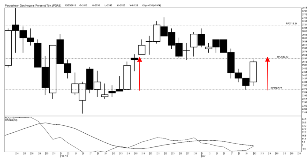
Kinerja saham PGAS

Danareksa research report are also available at Reuters Multex and First Call Direct and Bloomberg